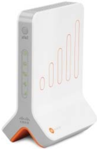
AT&T's 3G MicroCell, made by Cisco.

AT&T, which has been conducting trials in several areas, announced at the recent CTIA mobile telecommunications trade show that it will begin widespread commercial deployment of its 3G MicroCell femtocell this month.